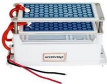
Figure 2. Ozone generator

When stimulated with UV light, the virus is prevented from reproducing itself by the differences in the chemistry of the RNA/DNA molecules. 12 V power supply was used in order to support electric energy. Output current is 8A. On the other hand, 18W fluorescent ballast was utilized to make the lighting elements work.